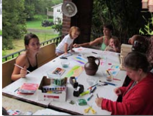
◀ Creating peace lanterns: It was a community effort, with markers, paints, scissors and pencils, wooden bases, dowels and drills—and a dozen OREPA members—making scores of peace lanterns for the Peace Lantern Ceremony in August.